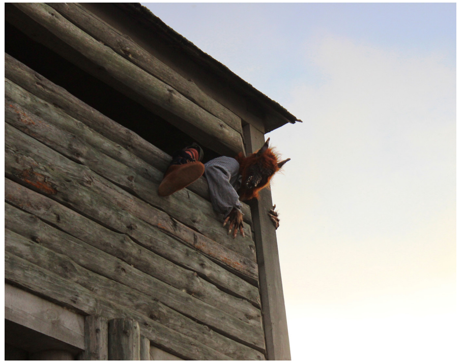
A werewolf prowls the blockhouse at Colonial Michilimackinac during Fort Fright. This event is complimentary to associates (excluding Heritage-level members).

In other wooden buildings within the fort and fur trading village, colonial ladies serve warm autumn treats like homemade molasses cookies and toffee. Guests can learn about death and burial in the 1700s, and the various traditions and ceremonies for the dead from over 250 years ago in the church. In addition