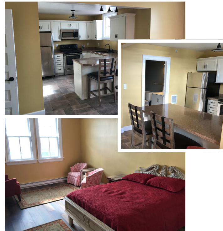
The Artist-in-Residence apartment features a full-size bed, living room space, full kitchen, bathroom, and incredible views of Haldimand Bay and the Straits of Mackinac.

The application process and schedule are available at mackinacparks.com/artist-in-residence .