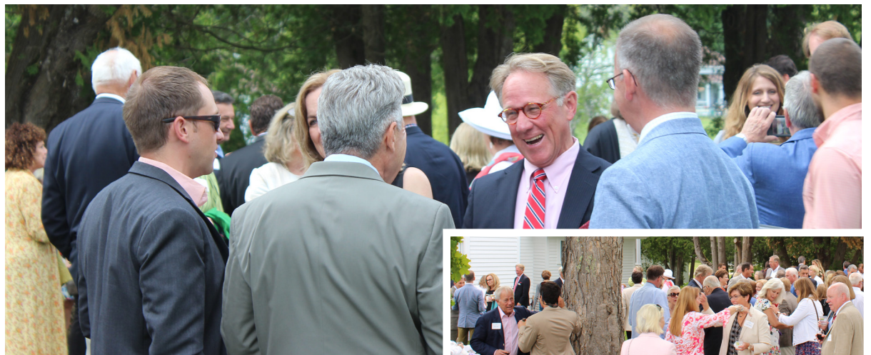
The 2018 G. Mennen Williams Mackinac Celebration was held at the Commanding Officer and Officers' Quarters next to Fort Mackinac.

Visit mackinacassociates.com or mackinacparks.com for more information on this wonderful event.